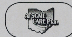
Dental, Drug, Vision, Hearing Aid

Have fun with the family this summer. Take advantage of AFSCME Council 8 members-only discounts to Ohio's leading amusement parks, along with water parks, and Ohio's zoos and Science Centers. Visit the Council 8 Web page at < http://afscmecouncil8.org/ > and register as a member to access these discounts.